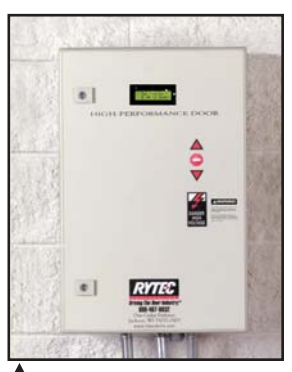
System 3 Controller Makes programming and troubleshooting easier, more flexible and more precise than ever.