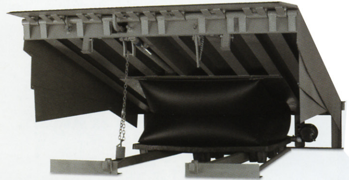
AP Series 7' x 10' 50,000 CIR shown.

Pound for pound, the deck and sub-frame structure of the AP Series Leveler is superior to competitive models and will provide you with years of reliable service.