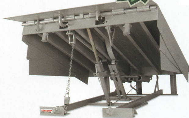
CM Series 6' x 8' 25,000 CIR with CleanSweep Frame™ and Full Range Toe Guards shown.

Periodic maintenance, inspections and clean-up is made easy by adding popular options to your CM Series Leveler. Our CleanSweep Frame™ allows unobstructed access to the pit area. By adding an optional Lip Support Service Strut the lip can be serviced independently of the deck. A permanently mounted, lockout/tagout compliant maintenance strut is standard.