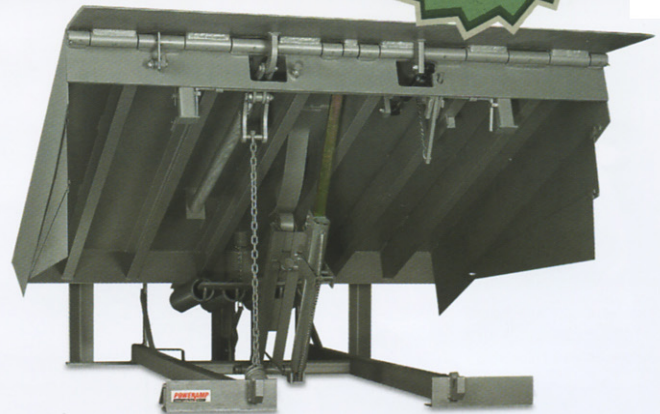
HM Series 6'x 8' 30,000 CIR with CleanSweep Frame™ and Full Range Toe Guards shown.

Periodic maintenance, inspection and clean up is made easy with the HM Series Leveler. Our CleanSweep Frame™ allows unobstructed access to the pit area and is standard on all HM Levelers. The maintenance strut is permanently mounted and lockout/tagout compliant. A separate lip support permits independent support and servicing of the deck and lip.