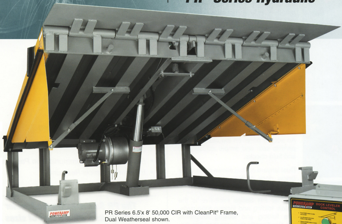
PR Series 6.5'x 8' 50,000 CIR with CleanPit® Frame, Dual Weatherseal shown.