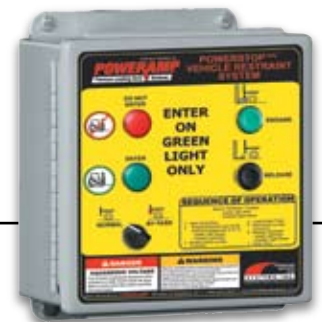
Dock Alert AAL Communication Package Shown