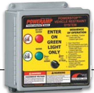
Dock Alert MAL Communication Package Shown