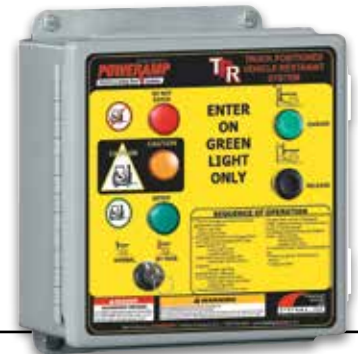
TPR® shown in with advanced communication controls.